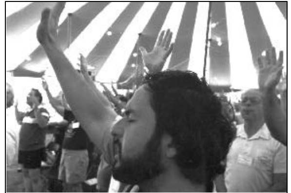
Photo from The Priests, Deacons, and Seminarians Conference at Steubenville, OH - June 1987