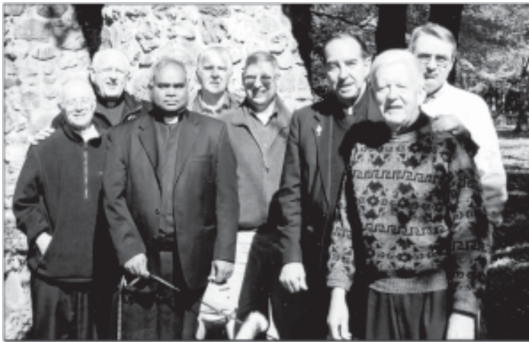
Members of the Hartford Fraternity enjoy a moment outdoors at their conference.

We picked the Sunday before Columbus Day to start and the following Wednesday after lunch to