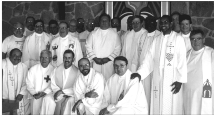
Fraternity priests gather in Saint Gerard’s Chapel, at Picture Rocks Retreat Center, Tucson, Arizona, during this year’s annual conference.

What determines priorities for faith and for pastoral care today is what God is doing. The real issue is Jesus’ question, “Who do you say that I am?” The framework is everlasting. What changes is the faith level within the Church and the readiness factors in the world. I will use the three elements of