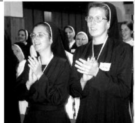
Religious in Slovakia (See story on page 3).

On one occasion while we prayed for those who had suffered during the Communist persecutions, the prophetic word came: "You are the new springtime of my Church.