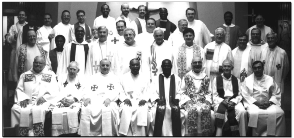
The Fraternity Brothers gather in the chapel at Cardinal Spellman Retreat House.

A particular way, indeed, the ultimate way in which we can abide in the Lord is through the Eucharist. Jesus after the Eucharistic meal says in the Gospel